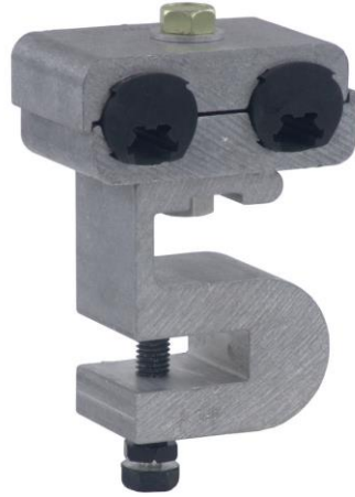
Figure 3 Galvanized steel down lead clamp