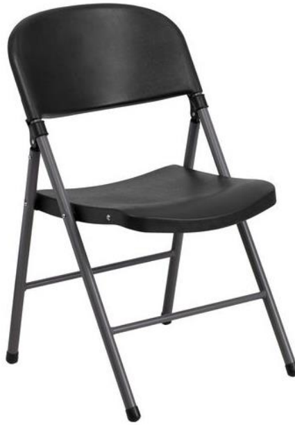
Figure 4 Foldable portable chair