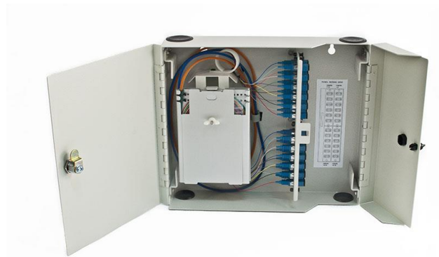
Figure 2 Wall mount Optical Distribution Frame (ODF)

The Indoor Optical Distribution Frame (ODF) shall be used for the termination of the Fibers in the building. The ODF shall be wall mounted and designed to provide protection for fiber splicing of pre-connectorized pigtails and to accommodate connectorized termination and coupling of the fiber cables. It shall be supplied complete with 48 port patch panel, SM pig tails with SC connectors, splice tray cassettes, splice sleeves, cable glands and wire management where necessary.